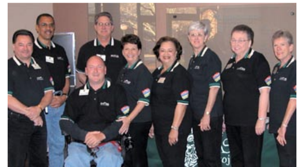
Active and Retired Motiva volunteers take part in Jason Science Project held annually at Lamar in Beaumont.

Active and Retired Motiva volunteers take part in Jason Science Project held annually at Lamar University in Beaumont. The JASON Project, founded in 1989 by Dr. Robert D. Ballard, is nonprofit educational organization headquartered in Ashburn, VA. Its mission is to inspire in middle grade students a life-long passion for learning in science, math, and technology through hands-on, real-world scientific discovery. If you recognize Robert Ballard's name, it might be because he discovered the remains of the Titanic.