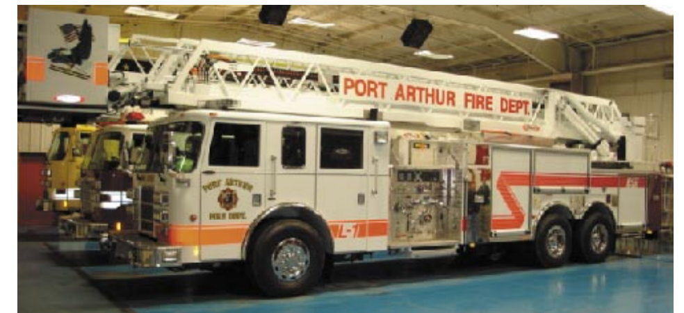
New Fire Truck for the Port Arthur Fire Department