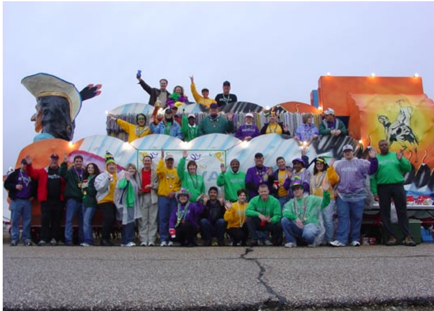
Motiva Employees, Spouses and Friends participating in the 2006 Port Arthur Texas, Mardi Gras Days